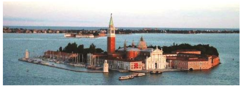
Venice, Italy June 2011