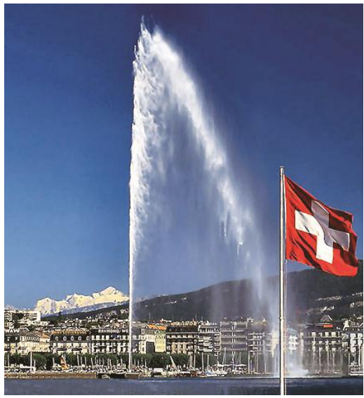
Geneva, Switzerland June 2012

"New Challenges for Global Trade and Sustainable Development"